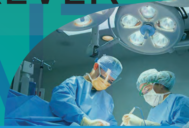
VASTMED Quality Products, Competitive Pricing, and Reliable Services