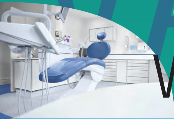
VASTMED Dental, Medical, and PPE Products