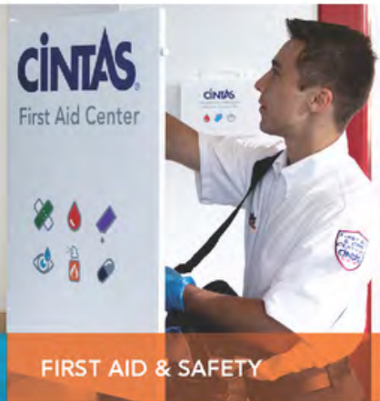
FIRST AID & SAFETY