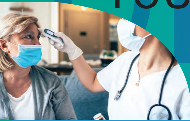
VASTMED Innovative Technology Solutions & Services